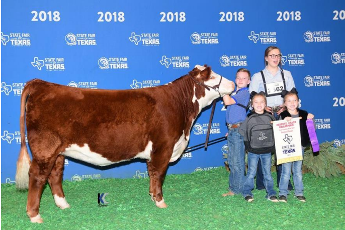
Reserve Champion Hereford Heifer 2018 State Fair of Texas