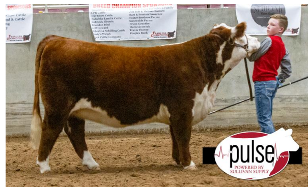
Champion Hereford Heifer - Levelland