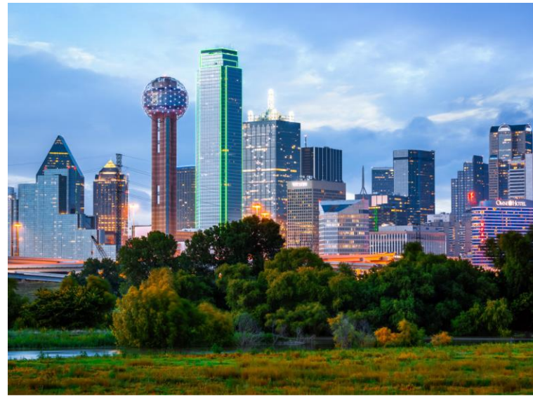
Coming in July..... Texas FFA State Convention

If interested, let the ag office know. There are test bank questions with most of these and its time to start studying.