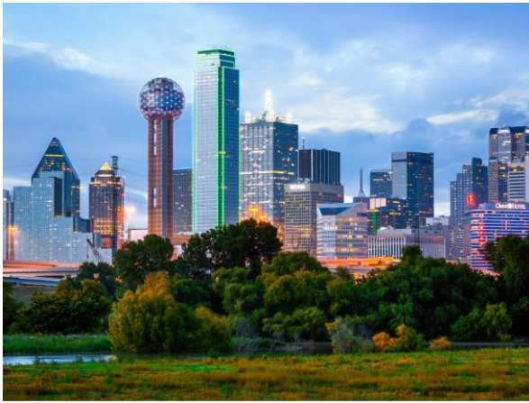
Coming in July..... Texas FFA State Convention